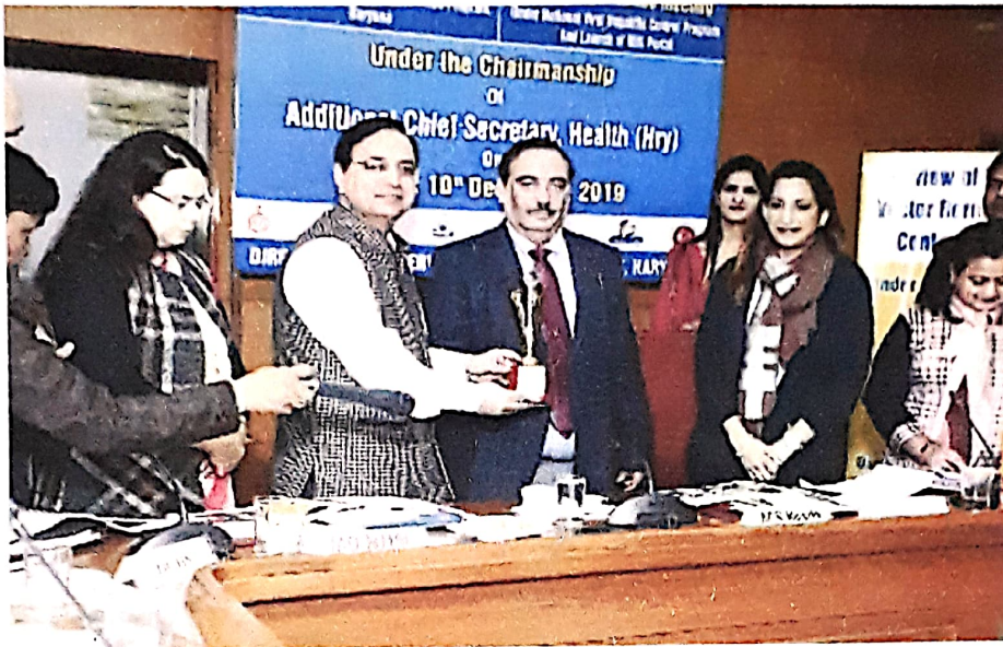
ACHIEVEMENT AWARD BY HEALTH DEPARTMENT HARYANA

Data Operator, Pharmacist, Peer View Support