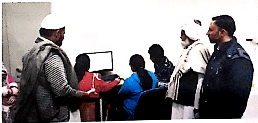
FACILITIES AVAILABLE AT DEPARTMENT UNDER NVHCP

Data Operator, Pharmacist, Peer View Support