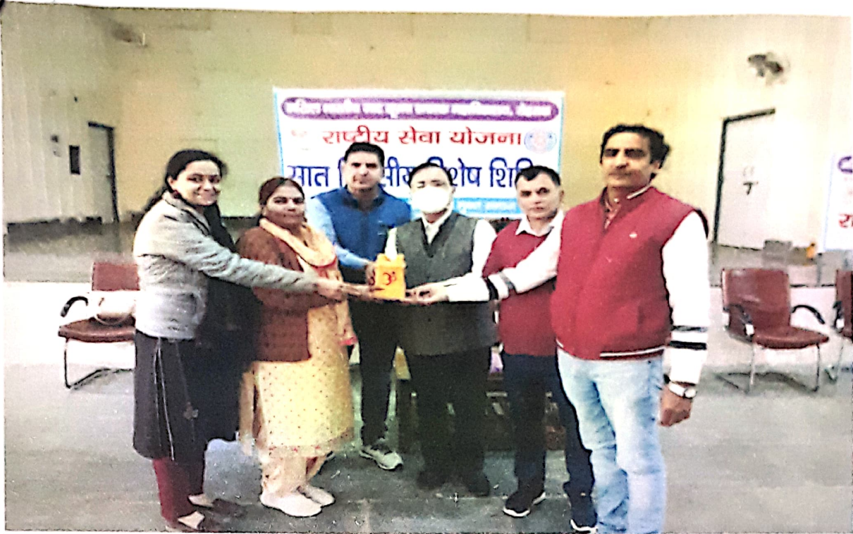
AWARENESS TALK AT NSS CAMP AT ALL INDIA JAT HEROES MEMORIAL COLLEGE, ROHTAK